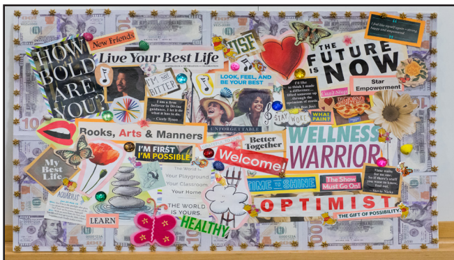
Completed project from previous MISCI session.

To learn more and find out if you are eligible, contact Penn: (415) 535-2769 or pweldon@openhousesf.org