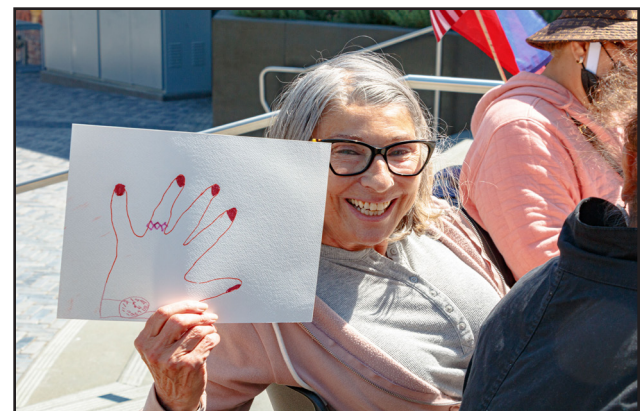
Community members enjoying the Summer in the City: Art Walk and Workshop event in August.