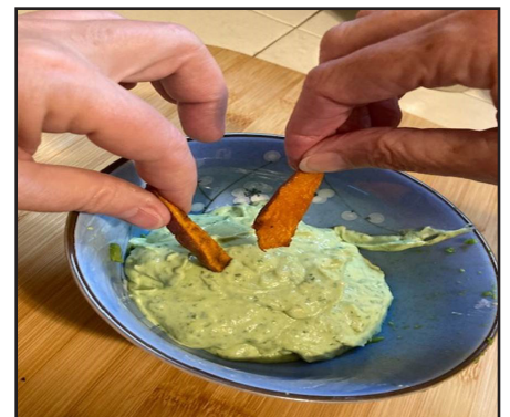
Community members enjoying a dip they made during a recent session of Cooking Matters

In partnership with 18 Reasons, a non-profit community cooking school, let's kick off Pride Month with food and community! We welcome all skill levels as we learn or sharpen cooking skills and enjoy a shared meal from the comfort of your home. In each of the four classes you'll learn a new recipe that centers simple, flavorful, budget-friendly food for the holiday season! Two days before each class you will receive a recipe along with the necessary ingredients delivered to your home.